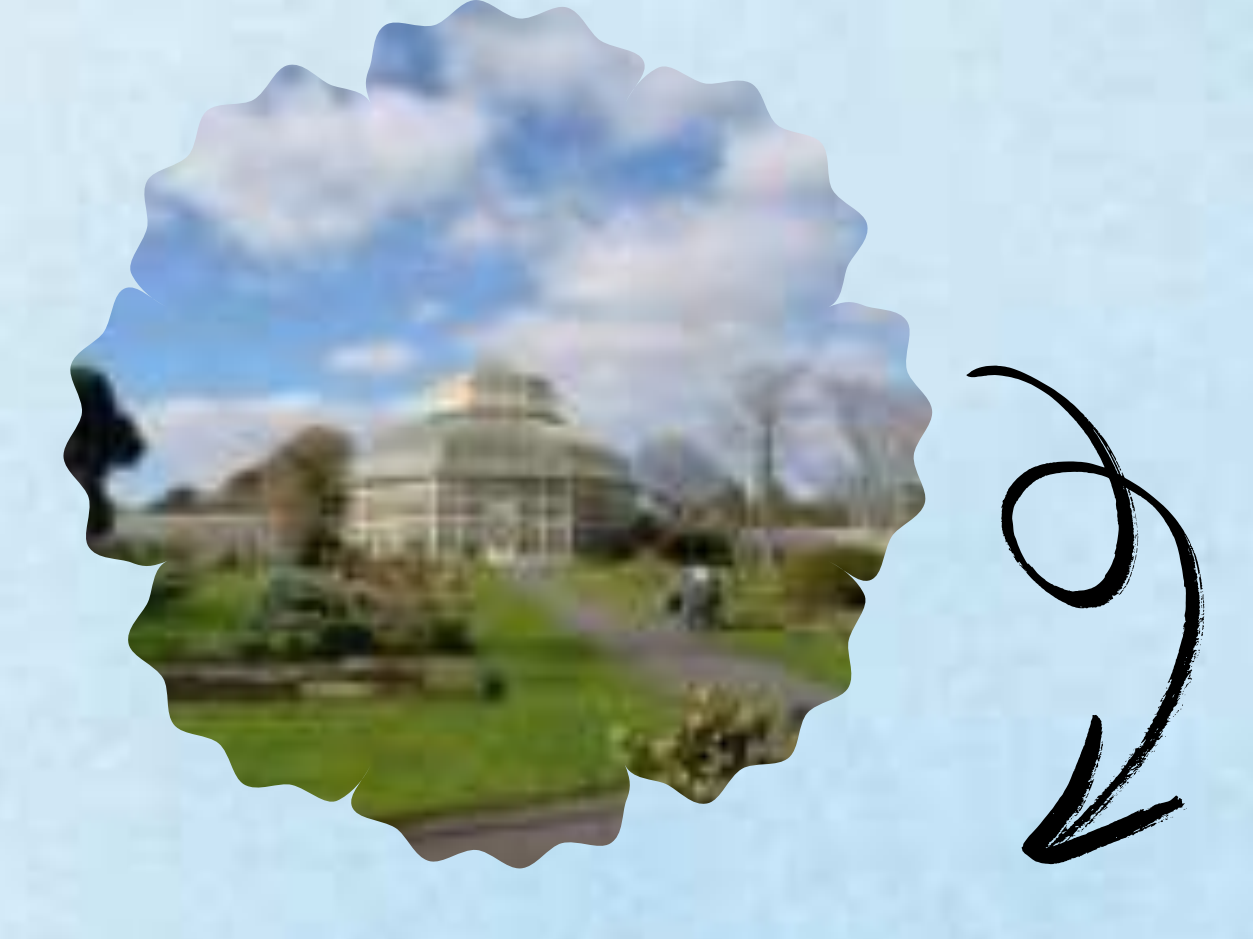
NATIONAL BOTANIC GARDENS